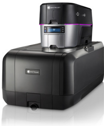
Single-hopper with embosser